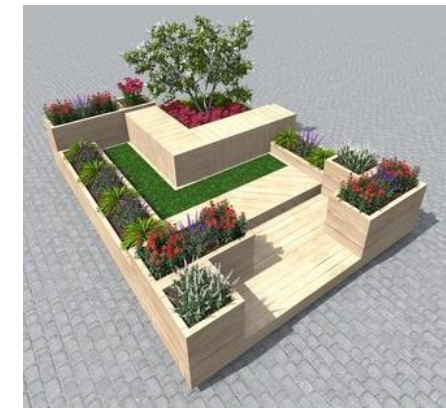
Examples from Flower Jam Festival link