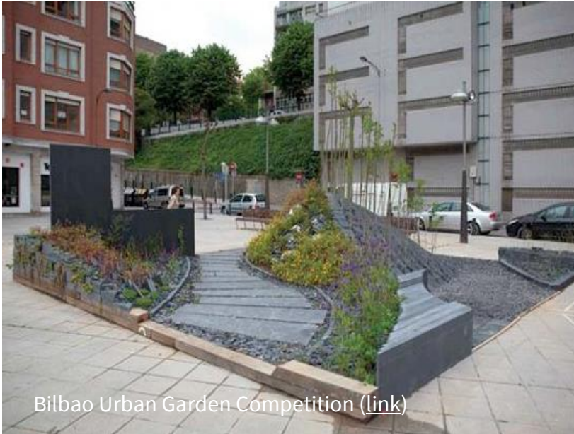
Bilbao Urban Garden Competition ( link )