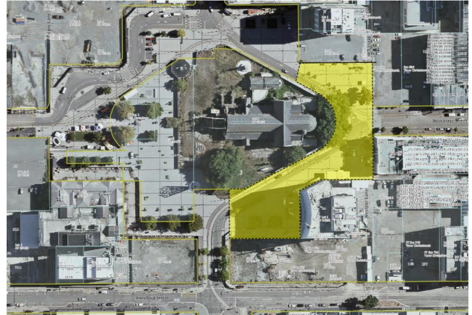
Location for Pop-up Gardens; Cathedral Square, Christchurch

This competition aims to show how small temporary spaces can bring people together, foster a sense of place, support local businesses and create enthusiasm and excitement about our regenerating city.