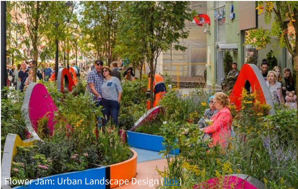
Flower Jam: Urban Landscape Design ( link )