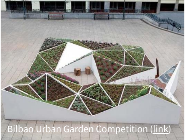
Bilbao Urban Garden Competition ( link )