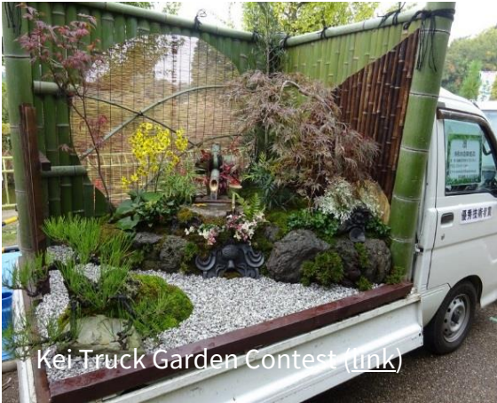
Kei Truck Garden Contest ( link )