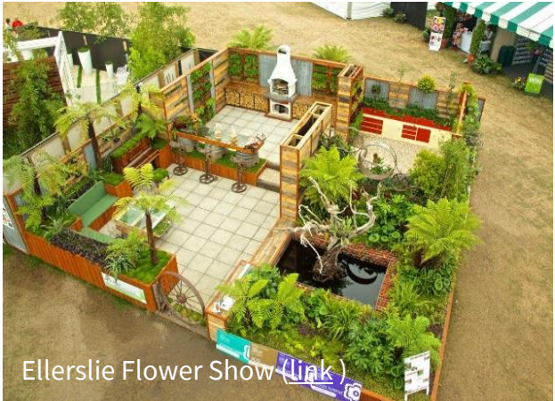
Ellerslie Flower Show ( link )